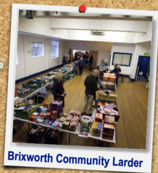
Brixworth Community Larder

https://www.brixworthparishcouncil.gov.uk/grants/parish-council-community-grants/